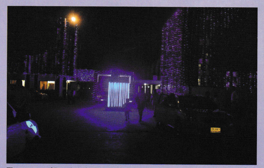
The campus of Bangladesh Shishu Academy was decorated with banners and blue light from 1 April to 3 April 2017 on the occasion.

Artists of Society for the Welfare of Autistic Children (SWAC) delivered a group dance with the song titled "2 April". The learners of PROYASH Special School charmed the audience with the deliberation of a dance based on a song titled "Nimphuler Ban". The autistic children recited different rhymes