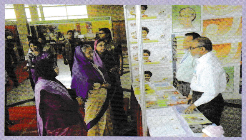
Hon'ble Prime Minister Sheikh Hasina visited a stall of ELCD project